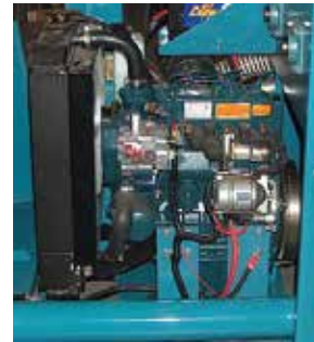
24.8 gross hp Kubota Diesel Engine